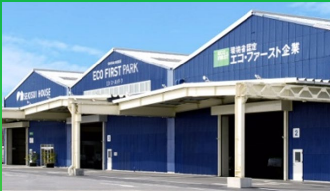
EXTERIOR WALL DISPLAY